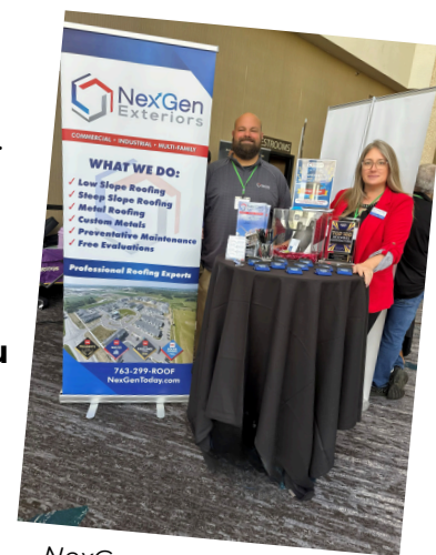
NexGen at the 2025 Trade Show & Expo

A: Bloopers get me every time. No matter how busy things get, those funny slip-ups are a reminder to pause, smile, and enjoy the lighter side of life—even in a fast-paced industry like ours.