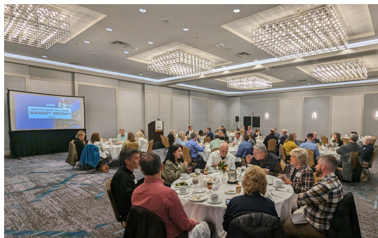
BOMA Members and Guests enjoy lunch at the DoubleTree Hotel on October 16th, 2023.

Now, this seems like good news, but we are limited to what the data shows, so the question remains how reported occupancy relates to physical occupancy with a sluggish return to the office.