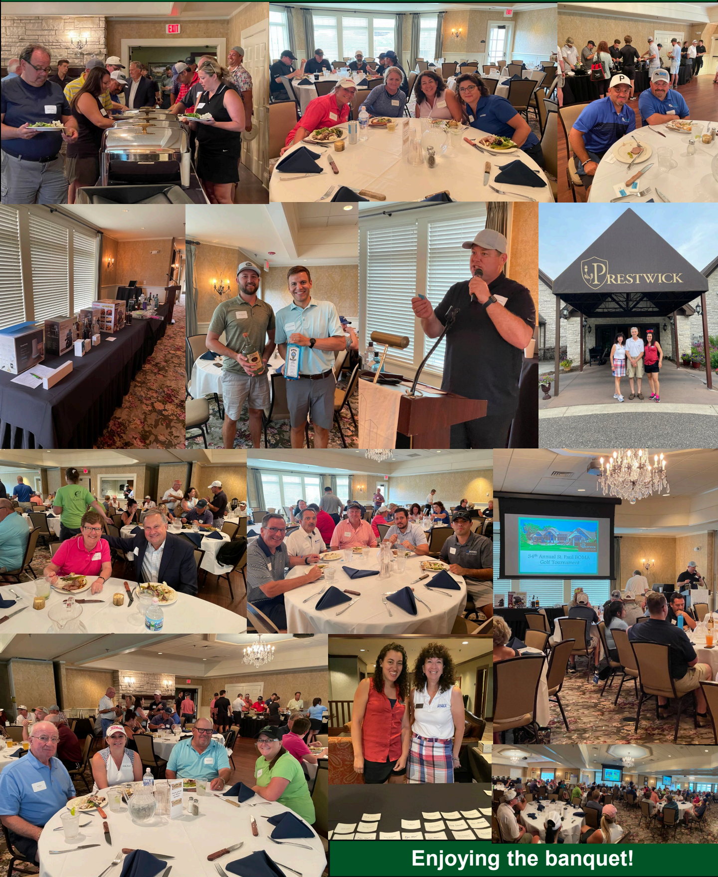
Enjoying the banquet!