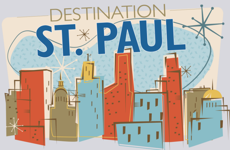
BOMA EXPO - DESTINATION ST. PAUL

BOMA EXPO SEPTEMBER 26th, 2019 NEW TIME! 3-6pm