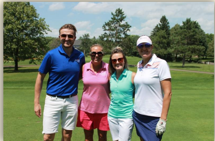
Sponsors and Golfers