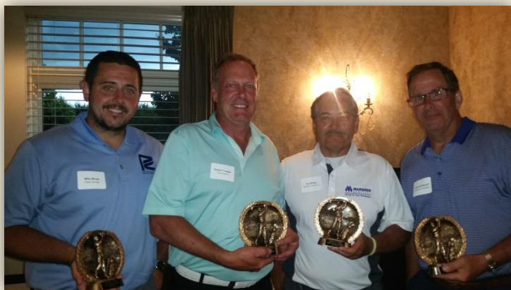
← First Place Winners!