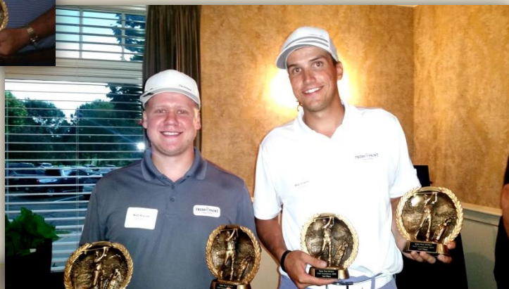
Second Place Winners! →