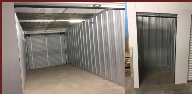
On the left is a look at a 10 x 20 storage unit and on the right is a 5 x 5 storage unit

downsize, seasonal items that people aren't currently using, and even some companies use them to store important documents. Their warehouse is filled with motion sensor lighting and camera system so that everything is secure and safe. They have various sizes for their storage units starting as small as 5 x 5 feet going as large as 10 x 25 feet. Recently, the most popular ones have been the 5 x 5 storage units. They've become so popular in fact that their fourth floor has been made with a majority of those and therefore has more units than the third floor. The third floor currently has 200 storage units with 15% vacancy and because of the demand for the 5 x 5s the recently added fourth floor has 250 storage units with 90% vacancy. They also have a special offer for BOMA members so click here for the Acorn Mini Storage Flyer if you are interested in taking advantage of this offer.