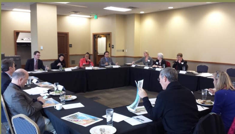
Ramsey County Commissioners and BOMA Board Annual Meeting.

Like the Ford site, Rice Creek Commons holds the potential of being a “city in a city”. With its combination of residential, office and retail, it will be a hub of investment, jobs, visitors and living spaces. For current information click here .