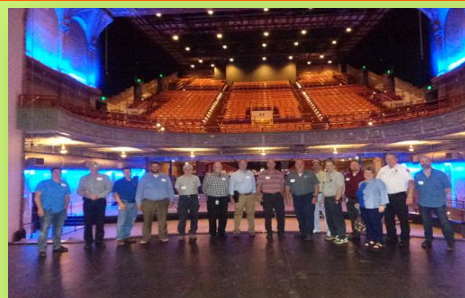
Supers Group Tour of Palace Theatre